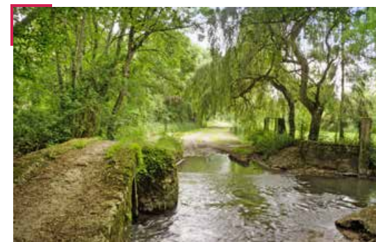
Gallo-roman bridge of Mondoux ford

This path gives you views over Choissille Valley. The source of this 26km river is at an altitude of 149m in the Nouzilly area and it runs into the Loire near Saint-Cosme bridge in Saint-Cyr-sur-Loire. The category 2 river is teeming with fish including brown trout.