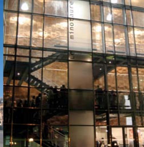
A close-up of the copper wall of Le Minotaure, a theatre designed by Gaëlle Péneau.