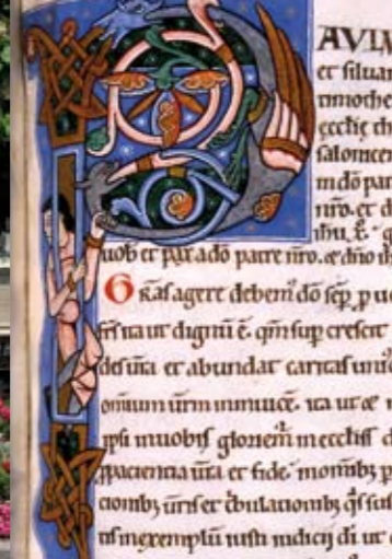
One of the 232 mediaeval manuscripts preserved in Vendôme's library. Commentary on the Epistle of St. Paul (Ms 23 - F.165 - 12th century).