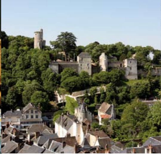
From the southern hillside, the castle and its park overlook the town.