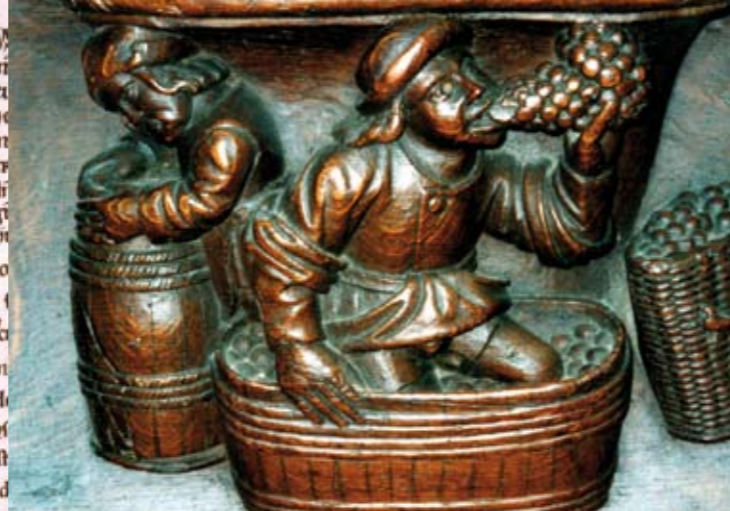
A sculpture of vigneron carved in the late 15th century on the choir stalls in Holy Trinity Church.