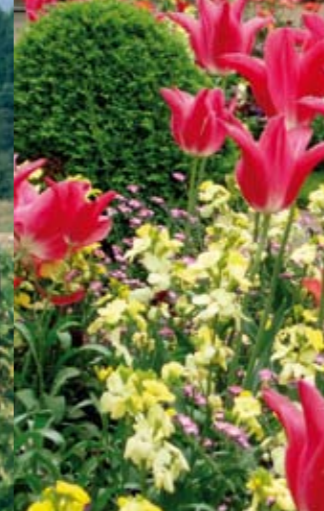
A close-up of flower beds in the Ronsard Park.