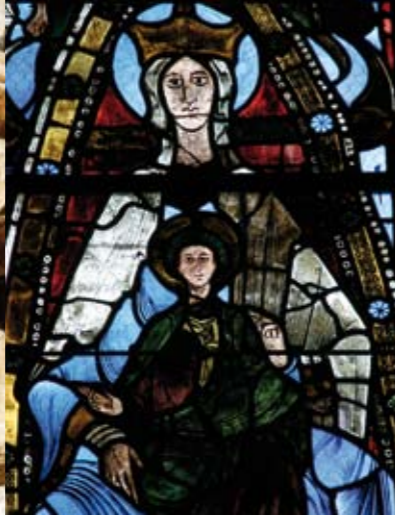
Madonna and Child, a stained-glass window dating from circa 1125 in Holy Trinity abbey church.