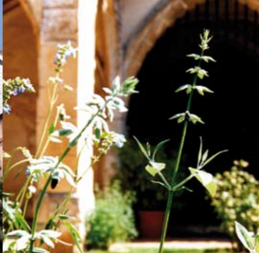
Numerous different botanic varieties (here, an Andean silver-leaf sage) bloom in the "Fragrance Garden" in the cloister garth.