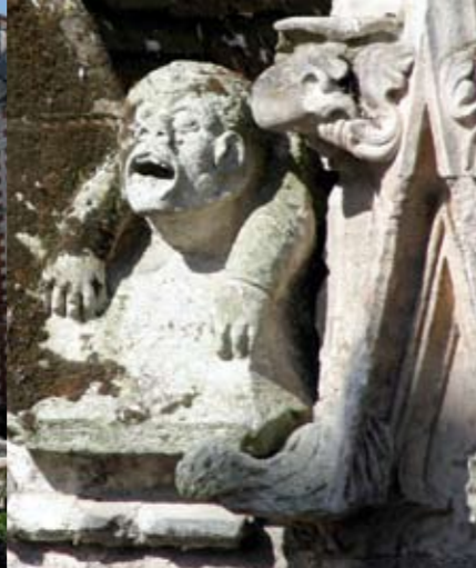
A close-up of a carving in St. James' Chapel (chapelle Saint-Jacques).