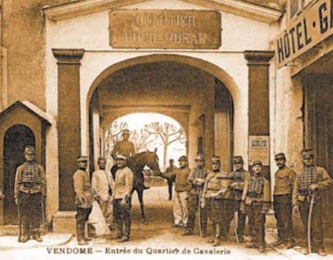
Soldiers from the 20e Chasseurs à cheval (light cavalry) in front of the Rochambeau Barracks in the former Holy Trinity Abbey.

From the ancient Benedictine abbey to the town's gates, all these picturesque places will tell you their own story.