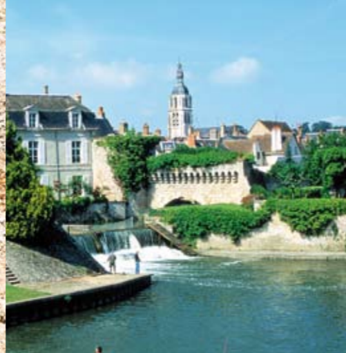
The watergate or Great Meadow Arch spanning the River Loir.