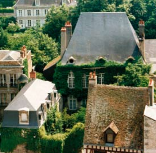
One of the private mansions in Rue Guesnault provided author Honoré de Balzac with inspiration for the story of La Grande Bretèche.

Since the 1980s and 1990s, urban development has continued beyond the southern hill that once formed a natural barrier. Property development was carried out in the south, in the district of Les Aigremonts (meaning "scarp slopes"), distributing the population and activities over a town that now has 18,500 inhabitants within an area that boasts a population of more than 30,000.