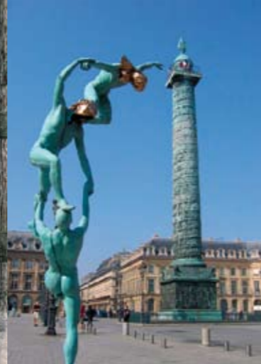
The mansion that belonged to the Dukes of Vendôme, was demolished when the royal square was laid out in the late 17th century but it has given its name to a famous square in Paris.