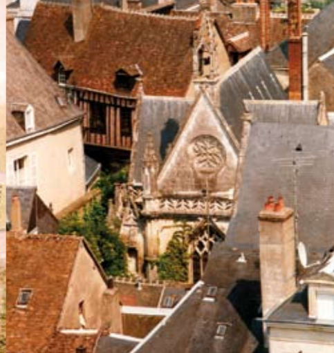
Private chapel of Our Lady of Pity.