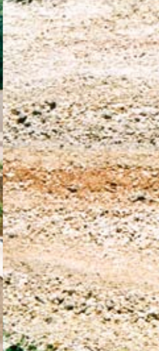
Limestone rocks on the southern-facing hillsides..