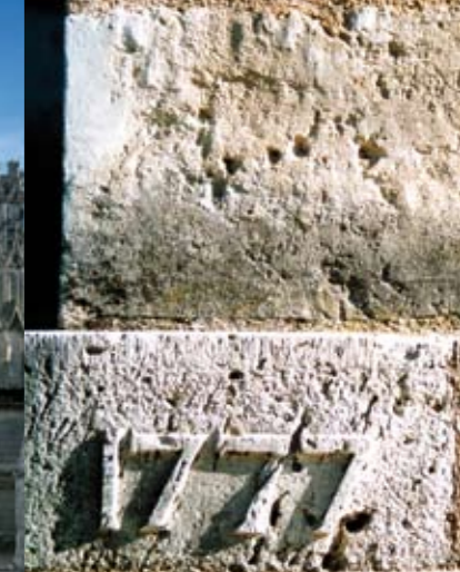
A close-up of the former Oratorians' high school.