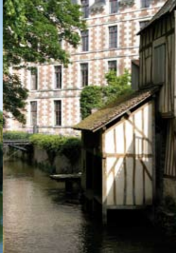
The Franciscans' wash-house (late 15th century).