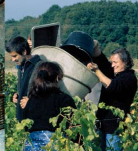
Harvesting on the hillside at Les Coutis.