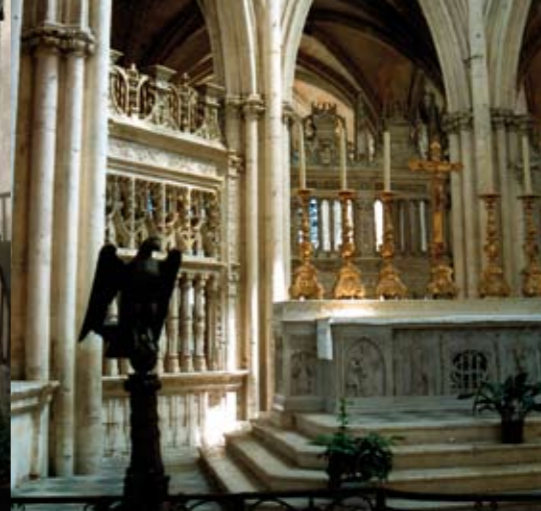
The chancel in Holy Trinity Church.