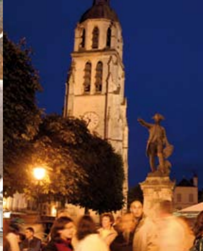
St. Martin's Tower rings out the hours, providing a rhythm to life in Vendôme.