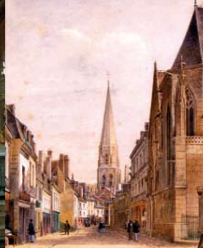
Rue du Change in 1856, a water colour by Gervais Launay.

There are two sightseeing walks starting from the Tourist Office, together designed to show you all the heritage buildings in the historic town centre.