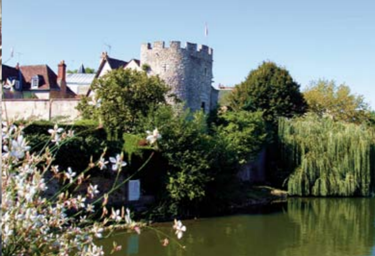
The Islette Tower.