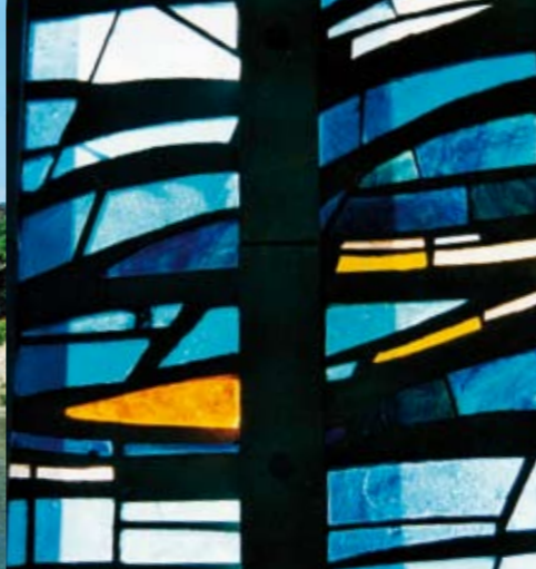
Contemporary stained glass by Anne Huet, Church of N.-D.-des-Rottes.