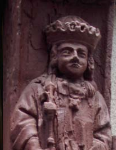
St. Louis on the Saint-Martin Residence..