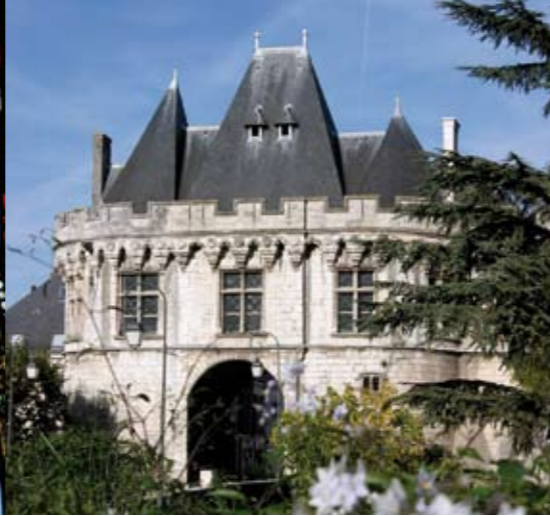
Since 1467, the St. George Gate has housed the meetings of the Town Council.