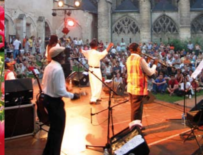
A concert during the Rendez-Vous de l'Été summer festival.