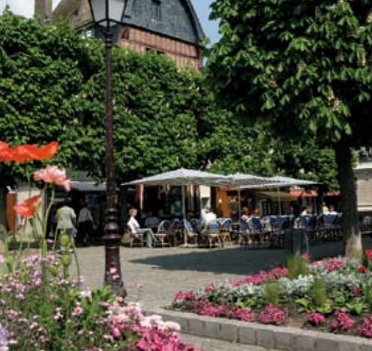
Place Saint-Martin in the town centre.

Pierre de Ronsard (1524-1585) "Odelette du Bocage" de 1554 - Livres des odes de jeunesse.