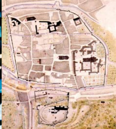
Vendôme in the 17th century copied by Gervais Launay in the 19th century.