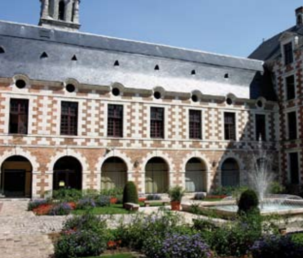
The main courtyard in the Town Hall.

From the playground in the old high school to venerable plane trees on the banks of the River Loir, see places steeped in history.