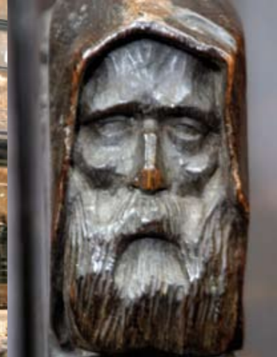
A sculpture of a monk on the choir stalls in Holy Trinity Church.