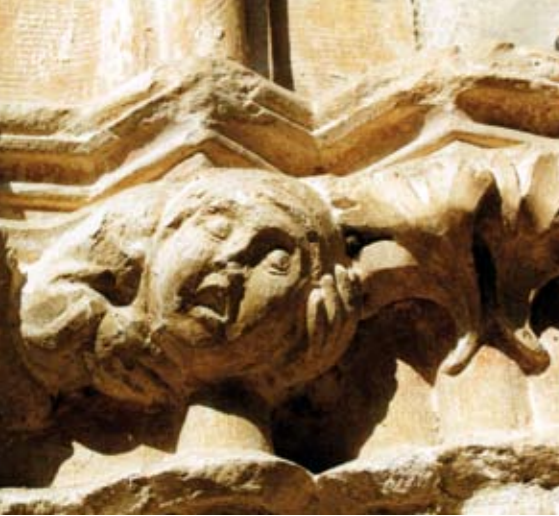
Sculpture in the chapter house.

Stroll through the streets of the town and look at its historic monuments. This walk takes you through the pages of the town's history.