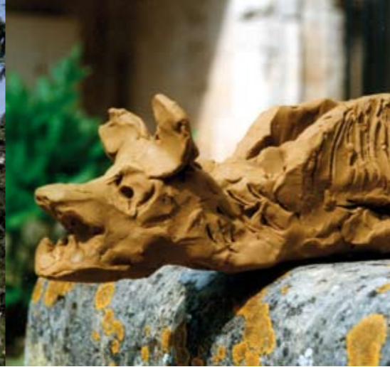
A clay gargoyle made in a children's Arts workshop.