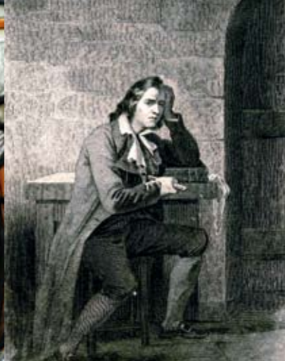
Gracchus Babeuf, one of the leaders of the "Conspiracy of Equals", was tried and executed in Vendôme in May 1796.