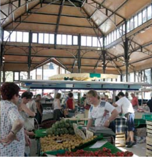
Every Friday, the streets around the covered market are filled with the bustle of the market.