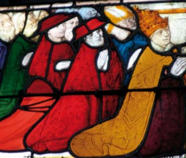
Cardinals and priests, a close-up of a stained-glass window in Holy Trinity Abbey Church.

The building of a high-speed train (TGV) station in 1990, bringing Vendôme to within 43 minutes of Paris, was accompanied by major changes in the town's economic fabric. It has particular expertise in three main, distinct sectors : aeronautics, domestic appliances and the automobile industry. Thanks to its wide range of shops and services, its dynamic cultural life and its many associations, Vendôme is now a regional centre for development covering an area that has a population of 70,000.