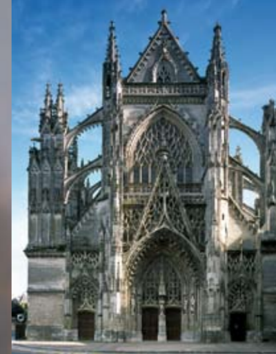
The Flamboyant Gothic façade of Holy Trinity Church.